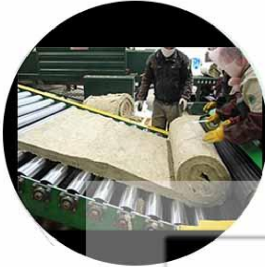
1. Plastic hot shrink packing