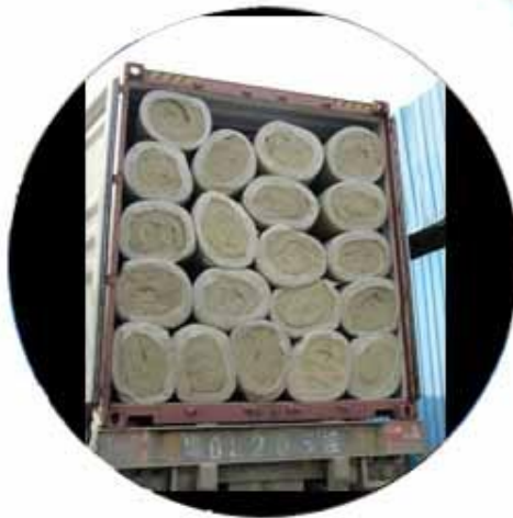
3. Container Loading