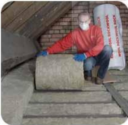
Attici roof Insulation