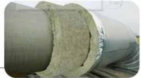
Big Industrial Pipe Insulation

Ecoin rockwool board can be used as thermal insulation and sound proof material for: